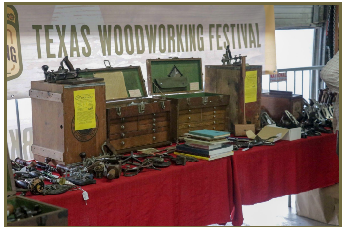
Vintage and antique hand tools from Dowd's Tools