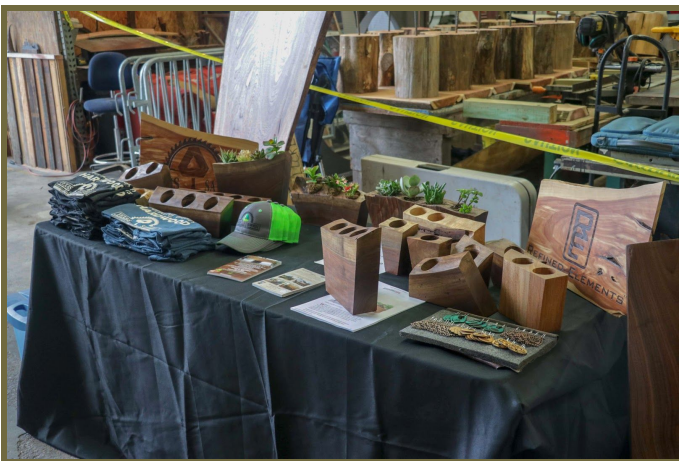
Texas Urban Sawmill