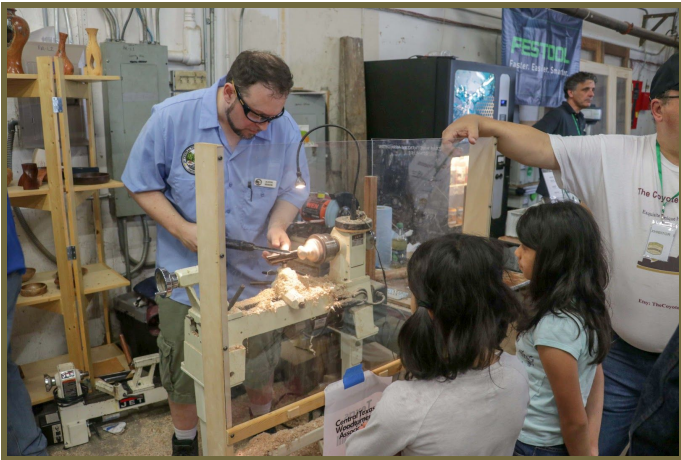
Central Texas Woodturners Association turning tops for kids