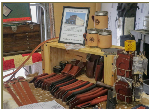
Texas Heritage Woodworks

Exhibitor (Retail Sales) - An exhibitor that is selling something during the festival. This includes merchandise, tools, classes, etc.